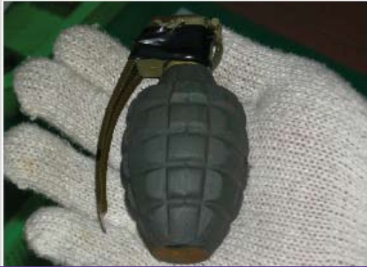
LOT LS42-81制式手榴彈 LOT LS42-81 grenade。