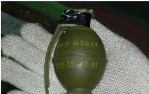
LOT P-4-104-78制式手榴彈 LOT P-4-104-78 grenade。

影〇〇七「明日帝國」中男主角的用槍。還有可當成衝鋒槍使用之克拉克26及19型手槍。外加兩枚制式軍用手榴彈，以及117發美國警方配備具有高制止力之「減速度」。