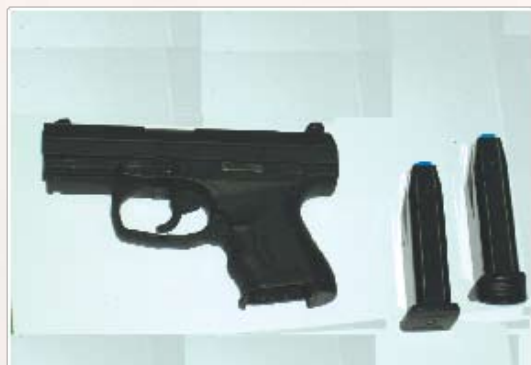
P99CQA型手槍 The P99CQA gun。