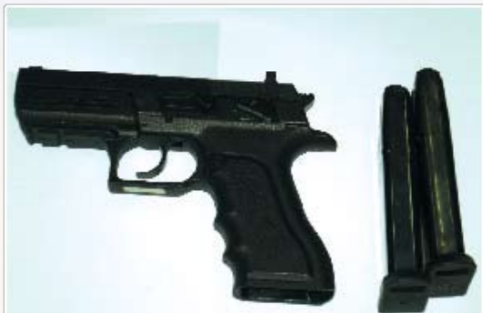
以色列製IWI型手槍 The IWI type made in Israel。

The arms, seized in the case, were all the internationally famous types of good capabilities, which could provide enough power for a small-sized shock troop. One of the guns--USP-- was manufactured by the German factory- H & K and moreover, the same type, having been used by Angelina Jolie starring in Tomb Raider, were to provide special forces. This short but powerful gun could shoot through the wall made up of marble and dig a big hole on it. We also found the pistol—P99CQA—developed and manufactured in 2004 by Walther, the other German factory, which also provided for special forces and has been used