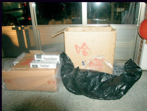
● 查獲私菸以黑色防水袋包裝 The illicit cigarette busted are wrapped in black waterproof bags

On the same day, at 21:00 the Taichung Coast Guard platoon received intelligence from the head Coast Guard bureau crackdown team and the Southern Regional mobile Coast Guard platoon citing that captain Lou xxx-hsing of the Tainan-based fishing vessel SS Yung Jih # ( ) was attempting to smuggle in illicit cigarettes through Chang Hwa's Wang Kong sea areas at around 22:00. Commander Ba Yi-ning conducted the crackdown move upon grasping the scenario, sets up a taskforce working with the head Coast Guard bureau crackdown team, the Southern Regional mobile Coast Guard platoon, the Changhwa crackdown team, the head coastline patrol platoon, the 41st platoon, and assigns deputy commander Wu Jin-her to round up the men on duty and command two near-coast patrol ships of SS PP508 and SS PP2051. Through search efforts, the vessel has been spotted around 22:20 one nautical mile off the coast of Han Bao, Changhwa, the team found the ship loaded with illicit cigarettes. After the team brought the ship back to the platoon and through the associates' inventory working, a total of 85,810 packs of an assortment of nine cigarette brands have been accounted for. In the initial interrogate the suspect captain Lou xxx-hsing admitted to the crime. The case has been turned over to the D.A.'s Office in Changhwa on charges of allegedly violating the National Security Act and the Tobacco and Alcohol Administration Law.