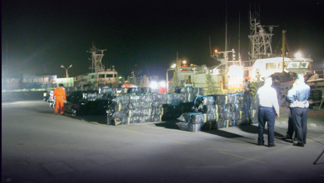
● 同仁漏夜搬運清點私貨工作 Associates working hard to inventory the illicit stash overnight

and caught on the spot mentioned on the above. He was taken back to the platoon, pending further investigation.