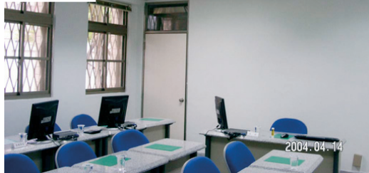
● 投影機及桌上顯示器 Projector and desktop monitor

組業務並受主管機關考核，考核項目包括稽核案件數量、行政效率、稽核品質、服務及廣度等五大指標，主管機關公布 92、93 年度採購稽核小組績效考核結果，在受評的 12 個中央機關中，本署與國防部、經濟部成績最優，總評分在 90 分以上，並連續兩年各獲頒優等獎牌乙面。