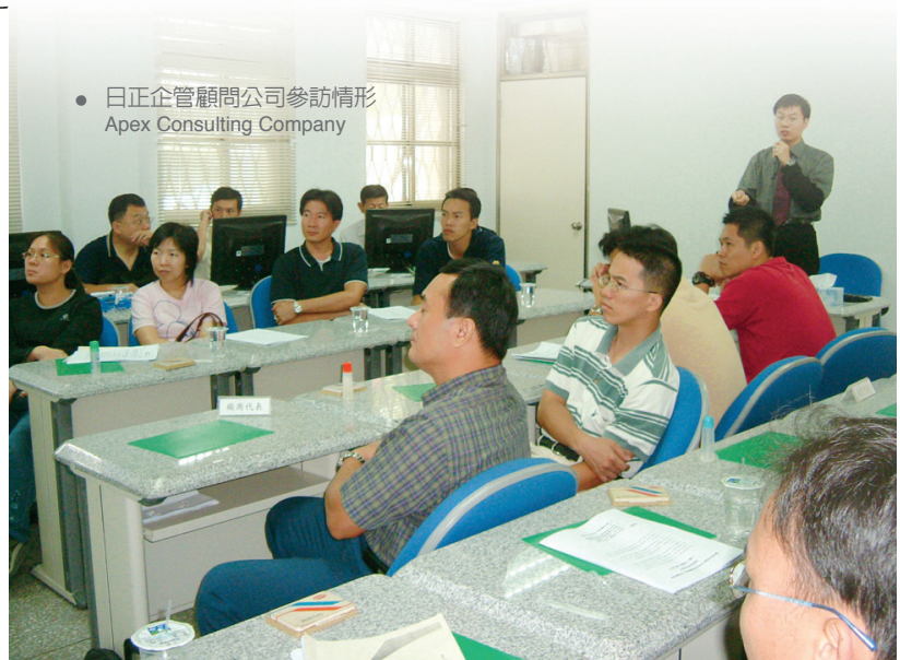
● 日正企管顧問公司參訪情形 Apex Consulting Company