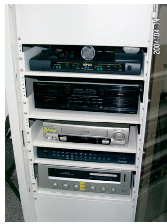
● 本署招標室監控系統 The Surveillance System of Coast Guard Administration