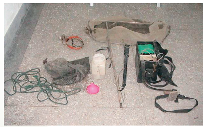
非法電魚工具 Tools deployed in illegal electrocution fishing

該嫌疑人已有多項毒、電魚前科,但該 員於偵訊期間對其所從事之行為並無悔意, 並一再辯稱,自己是用電燈照射海面以吸引 魚群,再用網子來捕撈魚,不是用電魚的方 式。對於現場查獲的竹竿和網子上有捆綁電 線並且接到電瓶,他也宣稱是上次電魚沒有 拆下,在聽到朋友說有鰻苗可以抓,趕在退 潮前去,急忙之下沒有注意就去抓魚,對其 所犯事實刻意避重就輕。惟就現場查獲嫌犯 所使用之魚竿和漁網皆捆有電線,並接附在 電瓶上,以及該員所得漁獲等證物皆顯示確 有電魚之情事,故將其移送法辦。