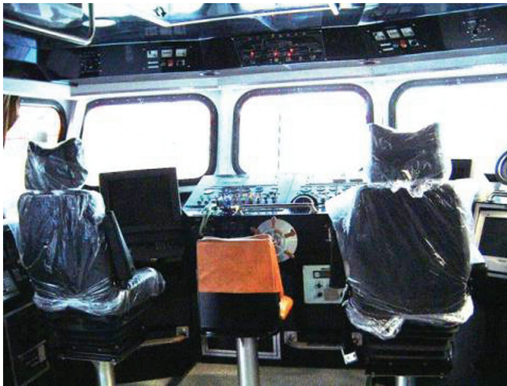
●大舟造五十噸級巡防艇駕艙內裝 The interior decoration of a second general 50-ton patrol boat

本型艇取得中國驗船中心（CR）合格認證，船艇採玻璃纖維強化塑膠材質（FRP）製造，船型為深V型，引用二部MTU柴油引擎主機帶動二部推進器及雙舵，屬於高速巡防艇，全長二十五米，造船界又稱其為二十五米巡防艇，船寬五點八米，模深三點一五米，最深吃水一點二米左右，最大船速三十二節，經濟巡航速率二十八節，巡航距離六百浬，每艘乘員八至十二人，出勤時可在艙艙各裝一挺T-75機槍，船上並有先進全球衛星定位系統、自動雷達等航海儀器，可同時追蹤八個衛星，顯示並輸出船位、船速信號，配合海洋巡防總局衛星控管系統，為本署十二至二十四浬責任海域內的巡弋主力。