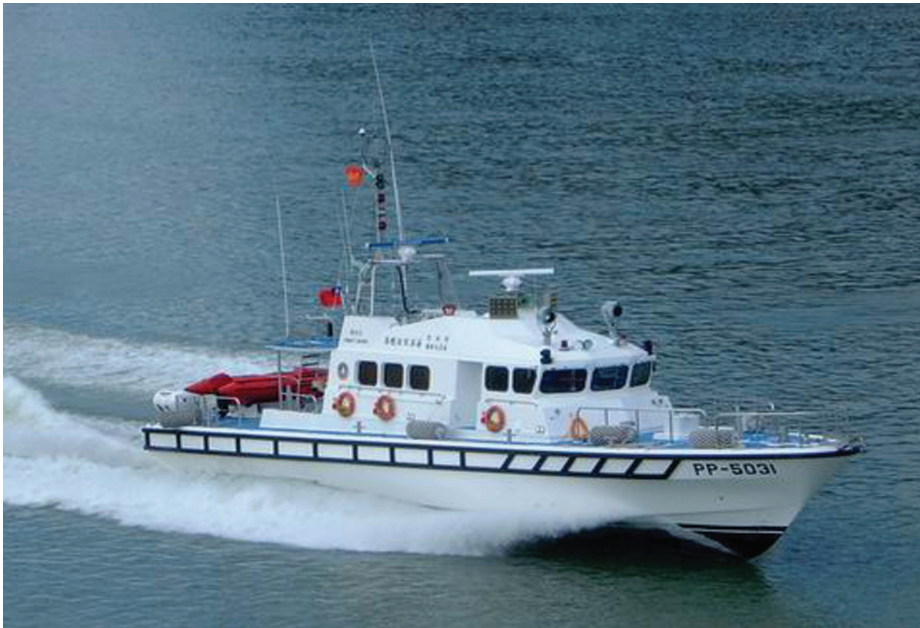
●大舟造五十噸級巡防艇英姿 A second general 50-ton patrol boat

民國七十七年，正是海上走私最猖獗的時候，當時甫成立的保安第七總隊（本署海洋巡防總局前身）爲了因應當時的局勢，特別規劃及編列預算建造十三艘二十五公尺長船速三十二節的五十噸級高速巡防艇，該型巡防艇由蘇澳龍德造船公司得標，並於民國七十八年起陸續完工交船，此款巡防艇於當時甫交船就投入第一線海上不法查緝行列，立刻發揮海上緝私的功效，所查獲的走私案件不計其數，績效驚人，迄今雖已捍衛海疆十五年，但威風仍不減當年。