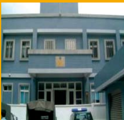
北巡局朝陽連哨－ 現為南澳安檢所 Jhaoyang Post of North Coastal Patrol Office-the present-day Nanao Inspection Office