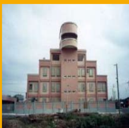
北巡局觀音連哨－現為桃園查緝隊 Guanyin Post of North Coastal Patrol Office-the present-day Taoyuan Reconnaissance Brigade

At this stage, the policies and construction projects were carried over from the predecessor of the Coastal Patrol Directorate General – the Coastal Patrol Command. The projects were mostly constructions of squadron, battalion and company posts.