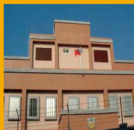
北巡局南樹林連哨－現為新竹查緝隊 Shulin Post of North Coastal Office-the present-day Hsinchu Reconnaissance Brigade