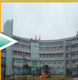
海洋總局高雄海巡隊