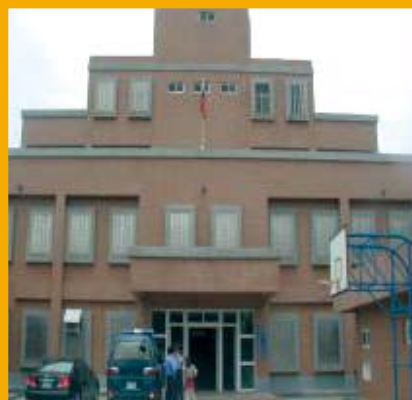
北巡局柯殼港連哨－ 現為防疫隔離廳舍 Kekegang Post of North Coastal Office-the present-day Quarantine hall shed