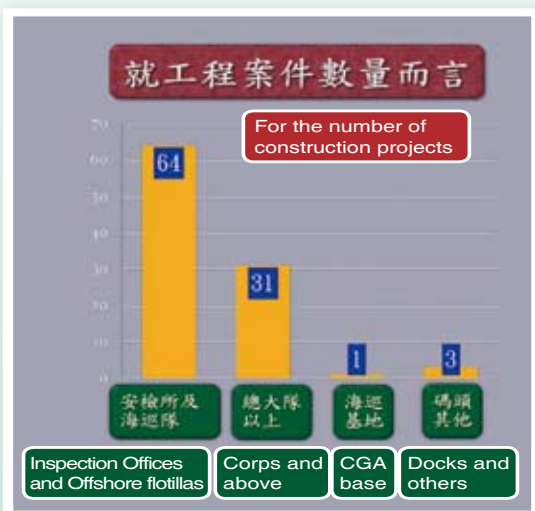
圖3 Figure 3

二、為推動各案工程順利執行及管制工程品質，本處除每月召開「公共建設推動會報」外，亦於工程進行於重要節點時（如地下室施作、樑柱鋼筋綁紮），主動邀請工程學者專家前往工地辦理工程查核，其中本署98年推動之公共建設，受行政院列管工程執行率為100%；另工程品質查核績效亦獲行政院工程會評定優等，且自89年本署成立迄今，各級機關辦理之工程案件均無貪瀆舞弊之危害署譽情事。