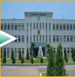
北巡局二四大隊-楊寮營區