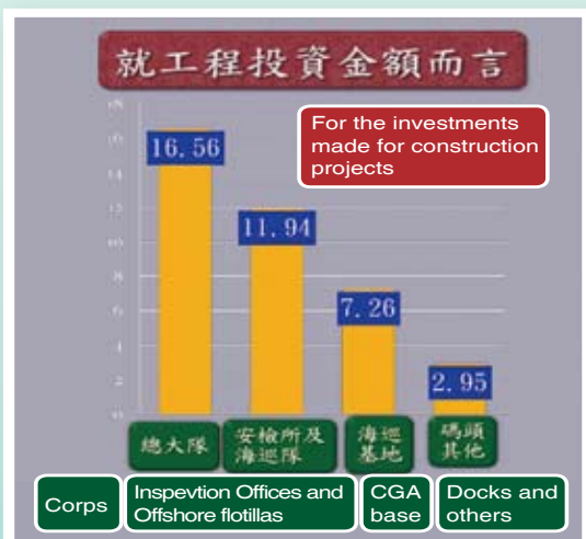
圖4 Figure 4