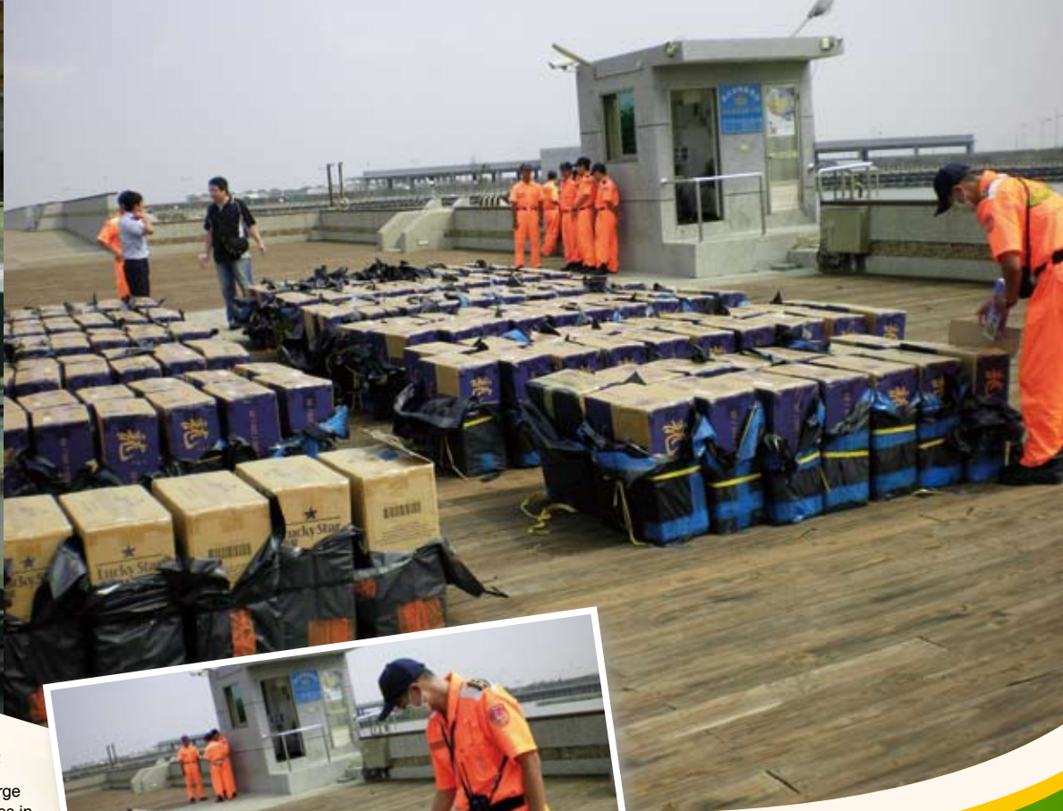
▲ 自密艙起出大量走私私菸 The CGA staffs found a large amount of bootleg cigarettes in the secret cabin.