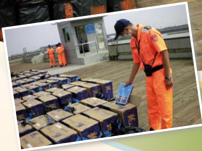
◀ ▲ 海巡隊員清點私菸數量，準備移送財政部國庫署及嘉義縣政府財政稅務局銷毀處置

The CGA staffs were making an inventory of the seized bootleg cigarettes, which would be referred to the National Treasury Agency and the Finance and Taxation Bureau, Chiayi County to be destroyed.