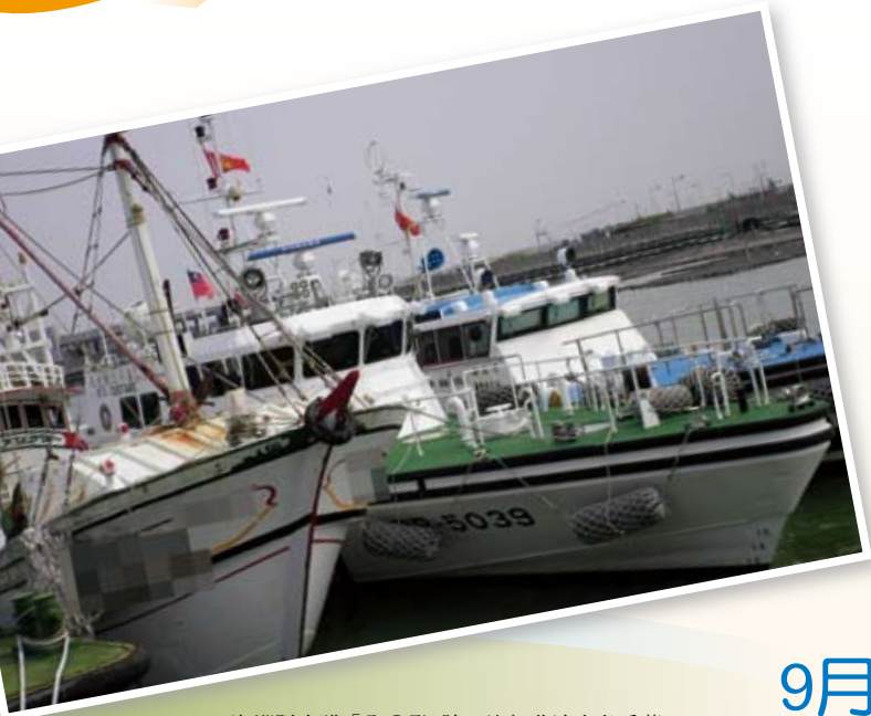
▲ 海巡隊查獲「全○發6號」漁船非法走私香菸 The CGA staffs seized bootleg cigarettes on "Cyuan-O-fa VI"