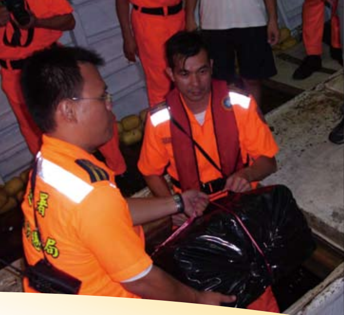
▲ 海巡隊員起出市價約新台幣伍佰萬餘元私菸 The CGA staffs seized bootleg cigarettes worth about NTD 5 millions at market price.