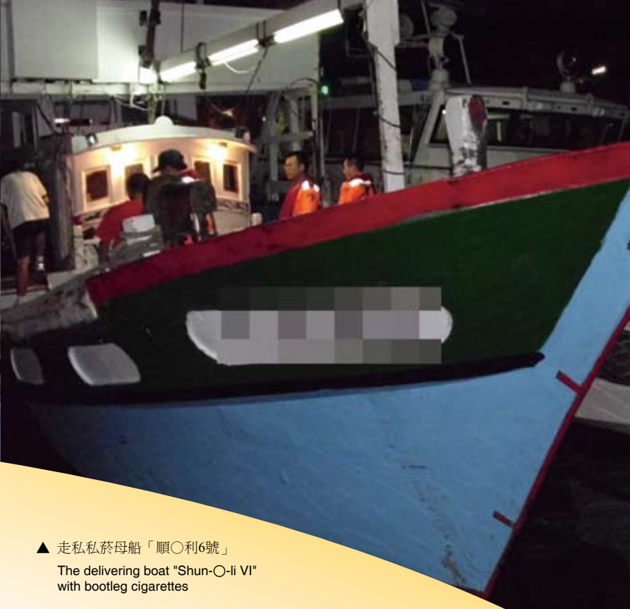
▲ 走私私菸母船「順○利6號」 The delivering boat "Shun-O-li VI" with bootleg cigarettes

同日20時10分，於三貂角外海14.3浬處（北緯25度04分、東經122度15分）發現雷達鎖控目標，該隊巡防艇以慢速接近私梟，在確認私梟併靠接駁私菸之際，立即開啟探照燈照明，只見「順○利6號」漁船甲板滿布黑色塑膠袋包裝之私菸，渠等犯罪情事確鑿明確。接駁舢舨見走私情事曝光，剎時分頭逃竄，此時PP-3575艇隨即高速追緝走私私菸母船「順○利6號」漁船並登檢，有效控制「順」船人員帶回依法偵辦，俟後並立即通報本署岸巡相關單位，加強查緝可疑逃逸舢舨，並持續擴大追查幕後集團，期能遏止不法犯罪。