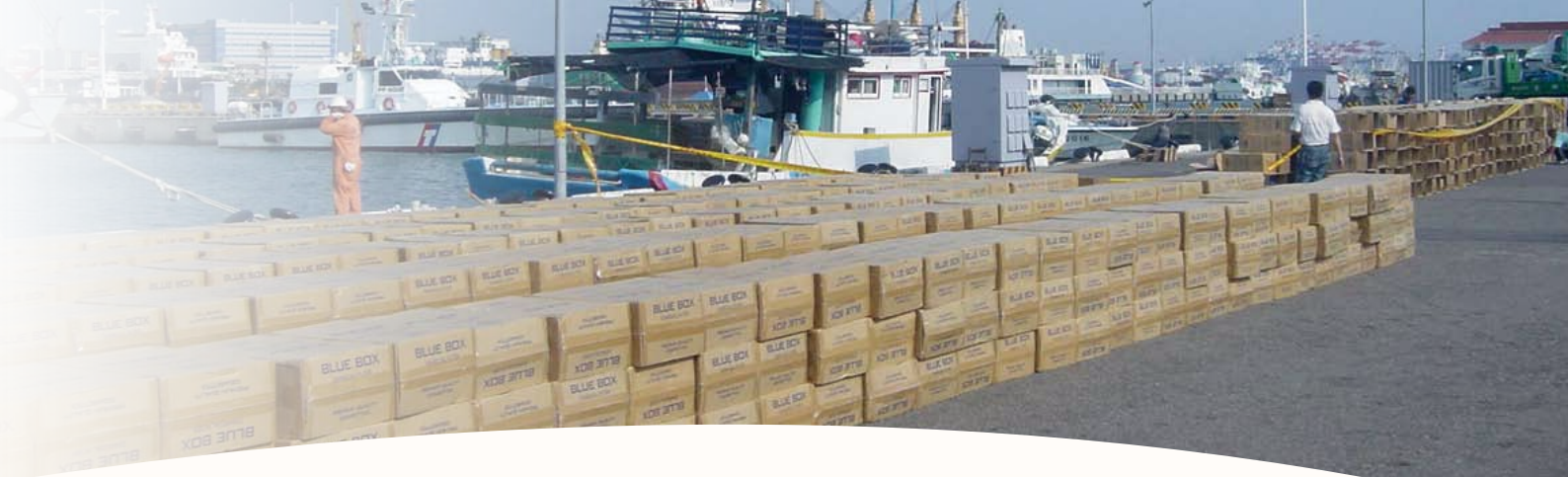
▲▼ 從兩艘漁船起出私菸總計599,890包，數量之多，歷年罕見 There were a total of 599,890 packets. Such a number was rarely seen in the history of cigarette seizures.